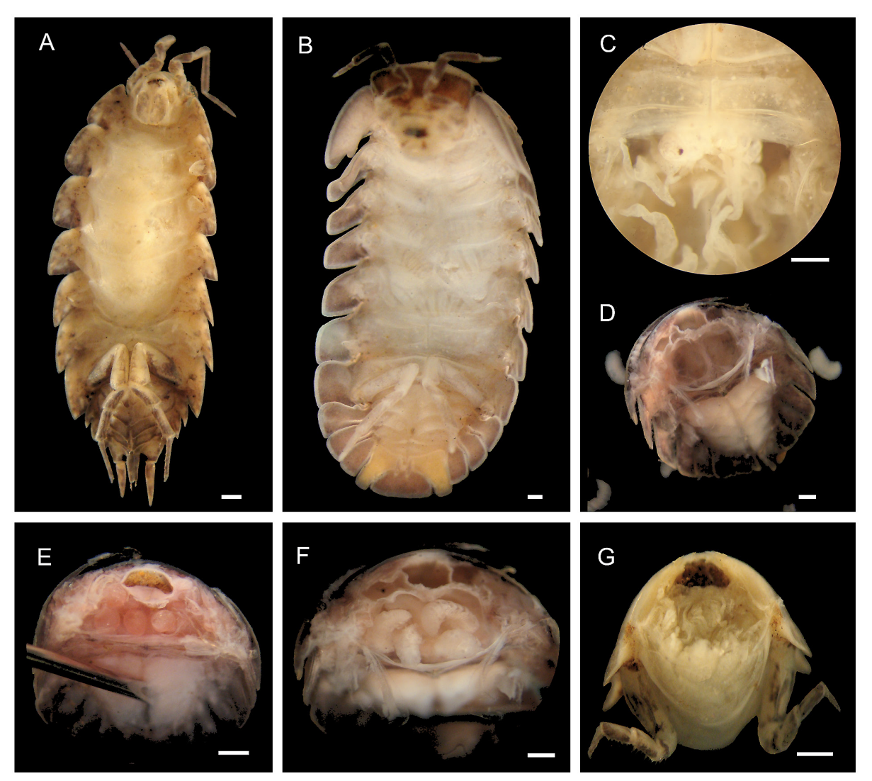
Figure 2. Marsupium in terrestrial isopods. A, distended marsupium in Balloniscus sellowii . B, non-distended marsupium in the conglobating Cubaris murina . C, manca of C. murina inside the marsupial extension. D, empty marsupial extension of Armadillidium vulgare , showing the space occupied by mancas upon their removal. E, beginning of the ovigerous period in A. vulgare , showing eggs and food inside the gut. F, late ovigerous period in A. vulgare , showing the mancas and an empty gut. G, late ovigerous period in B. sellowii , showing the mancas and the food inside the gut. Bar: 0.5 mm.

also be considered in future studies on the phylogeny within Oniscidea. To date, no similar structure has been found in Peracarida and for a better understanding of the structure of this extension structure and its implications for the life history of these species, further studies are needed.