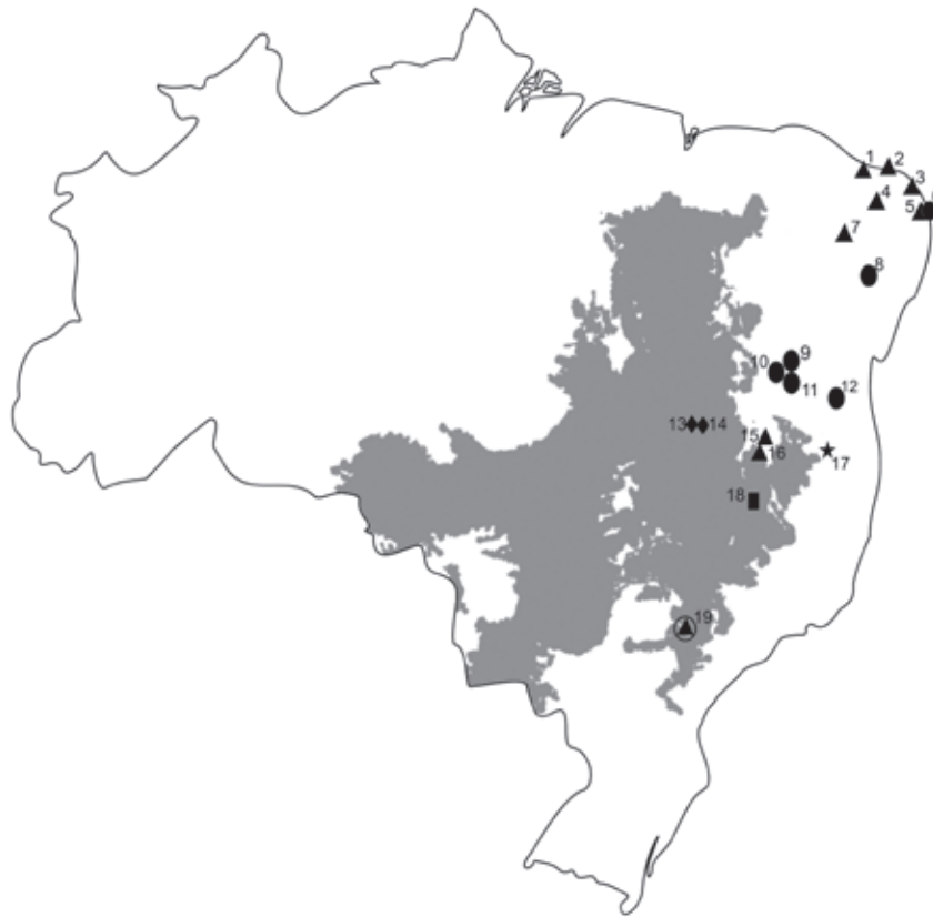
Figure 2. Distribution map of the species of Dendrocephalus Daday, 1908 in Brazil (following: Rabet and Thiéry, 1996, Souza and Camara, 1998; Lopes, 2002; Rabet, 2006 and this work). Localities are indicated in the text. Localities indicated from Pesta, 1921 are not enough detailed to be indicated in the map. Symbology: Star = the new species; Triangle = D. brasiliensis ; Diamond = D. goaisensis ; Oval = D. orientalis and Rectangle = D. thieryi . The grey area shows the location of the “cerrados” (from BIOMAS DO BRASIL: CERRADO. www.wwf.org.br/informacoes/questoes_ambientais/biomas/bioma_cerrado/mapa_bioma_cerrado ).