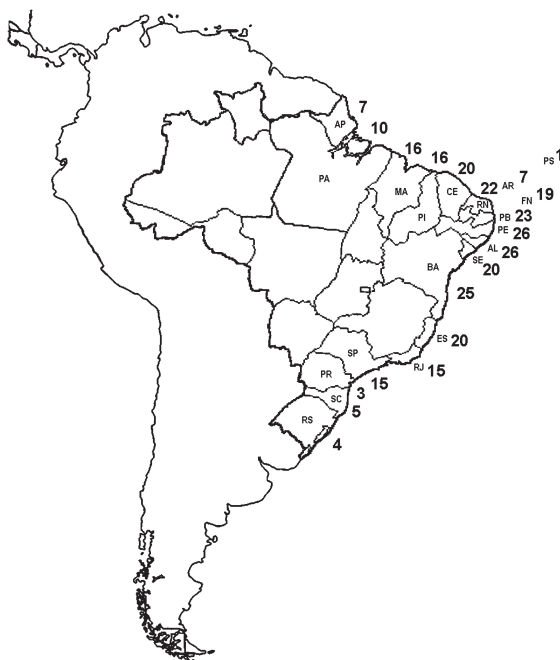
Figure 2. Number of species of Mithracinae by state along the Brazilian coast. For abbreviations see Table 1.

The dendrogram indicated three groups (A, B, and C) (Fig. 3). The “A” group was represented by the states of Paraná, Santa Catarina and Rio Grande do Sul, showing 15% similarity with the “B” or “C” groups.